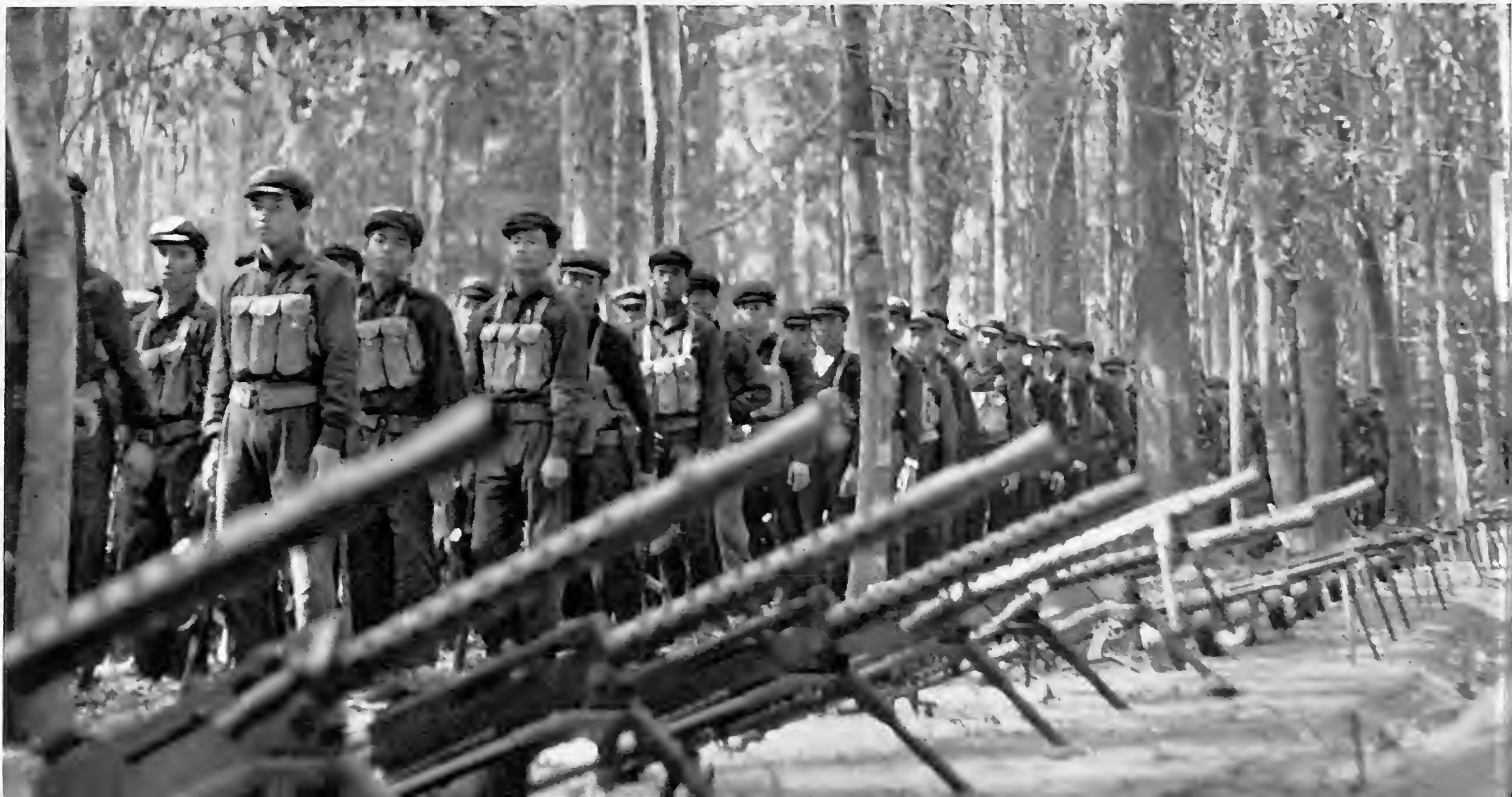
Weapons captured by the P.A.F.N.L.C. from the enemy.